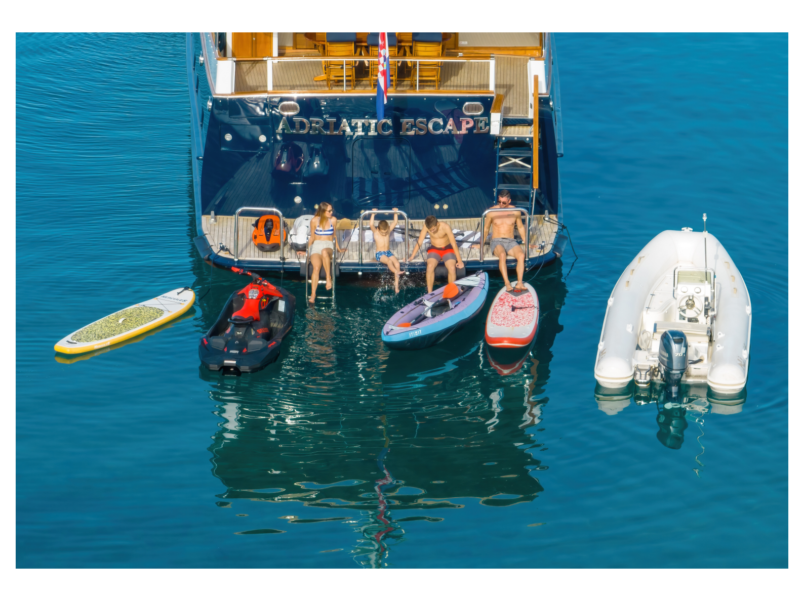
Burger 105 M/Y